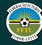
Federação Futebol De Timor-Leste (FFTL)