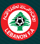
Lebanese Football Association (LFA)