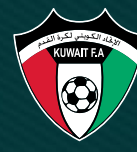
Kuwait Football Association (KFA)