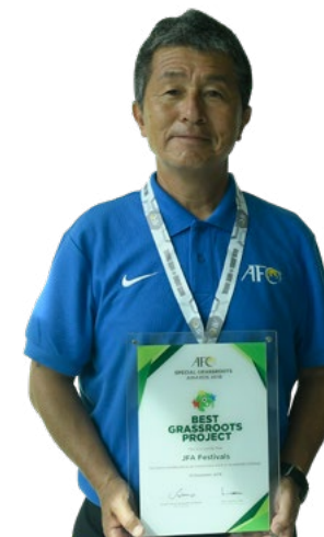
WINNER JFA Festival (Japan)