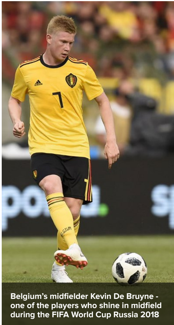
Belgium's midfielder Kevin De Bruyne - one of the players who shine in midfield during the FIFA World Cup Russia 2018