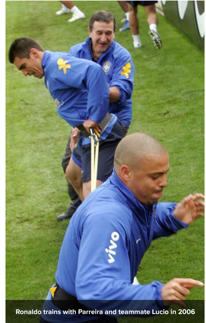
Ronaldo trains with Parreira and teammate Lucio in 2006

This is a good question. I have worked with some of the best players in the world, and the first thing you realise is that they are normal people, just like us, and they like to be treated as normal. They don't want to be treated differently in the dressing room or inside the camp. If you respect the player, he will respect you. You must show them that you care and give them your attention. Transparency is crucial. Whatever you have to say, you must say it to them personally. They like to hear from you. Next, there can be no special privileges for special talents. Everyone is treated equally. The bank accounts may be different, but in the national team they are all the same.