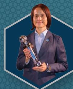
AFC Coach of the Year (Woman) ASAKO TAKAKURA (JPN)