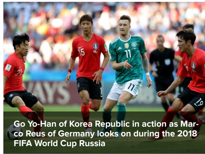
Go Yo-Han of Korea Republic in action as Marco Reus of Germany looks on during the 2018 FIFA World Cup Russia