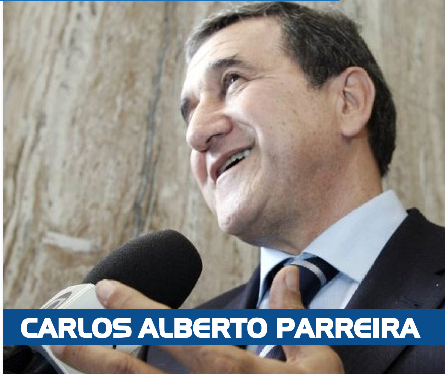
CARLOS ALBERTO PARREIRA