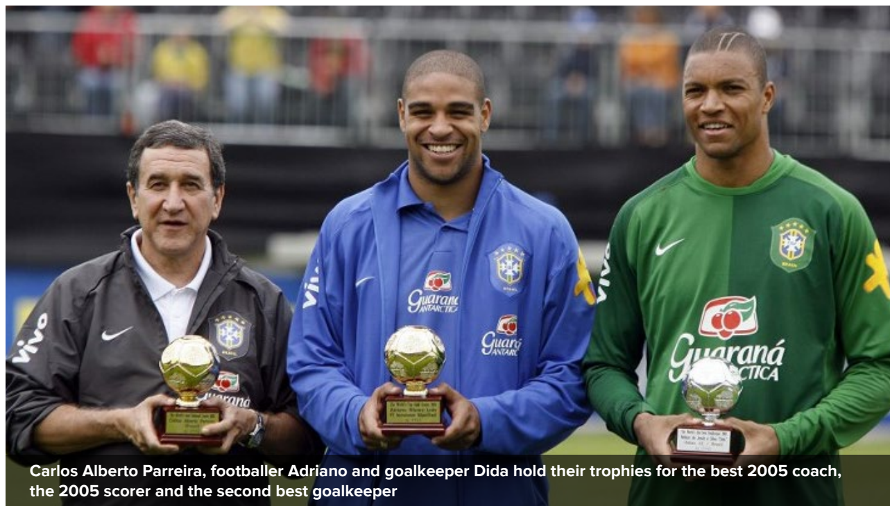
Carlos Alberto Parreira, footballer Adriano and goalkeeper Dida hold their trophies for the best 2005 coach, the 2005 scorer and the second best goalkeeper

Firstly, it is about mass participation. Many, many people playing football. In Brazil, there are 28 states and each state has its own league, with first, second and third divisions. Plus there are a multitude of youth leagues at different age levels. With so many players, you can find quality. It is a football factory which never stops – it is running twenty four hours a day. From the age of two or three years old, the kids have a passion for football. There is a love for the game – it is in the blood. The enthusiasm never diminishes. As soon as the team was eliminated from the World Cup in Russia, the Brazilians were already dreaming of winning the title in Qatar in 2022. We have a wonderful spirit of optimism.