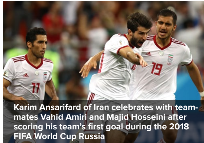
Karim Ansarifard of Iran celebrates with teammates Vahid Amiri and Majid Hosseini after scoring his team's first goal during the 2018 FIFA World Cup Russia

The question needs a long detailed presentation. But, as coaches, we know that you need a plan, a coaching routine and at least three years of working with the team. Look at Jogi Löw, the previous winner, and Didier Deschamps, the latest winner, and the time they had to build something. They were able to impose their philosophy with players that they knew well. You also need to win outside the field with your organisation, your relationship with the fans and the media and to have order and structure. Of course, to win the World Cup, you need to have three, four or five outstanding players who will bring quality to the team. You need experience and a well-defined way of playing. This depends on the culture of the country, the history of the team and especially the philosophy of the coach. Croatia played the same way from the beginning of the tournament, while France played the same way even during the qualifiers. They had their way and they kept it – this is so important. You must have all the components at the one time: tactically, psychologically, physically, technically. You can't make mistakes. You need to be focused and to make the necessary compromises for the sake of the team. As I have often said, it is very difficult to become World Champion because you have to implement so many things at exactly the right time.