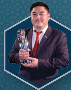
AFC Member Association of the Year (Aspiring) MONGOLIAN FOOTBALL FEDERATION