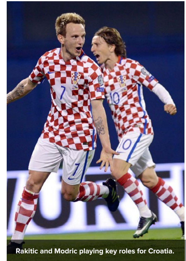
Rakitic and Modric playing key roles for Croatia.

by Brazil’s Fernandinho into his own net. If there was an element of good fortune in Belgium’s opening goal, their second was skill and precision personified: a driving run through midfield from Romelu Lukaku set up Kevin de Bruyne and, from the edge of the penalty box, the Manchester City man drilled the ball into the far corner to the Brazilian net. The bravery of coach Roberto