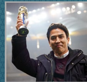
AFC Asian International Player of the Year MAKOTO HASEBE (JPN)