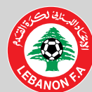
LEBANON FOOTBALL ASSOCIATION*