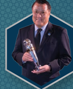
AFC Member Association of the Year (Inspiring) JAPAN FOOTBALL ASSOCIATION