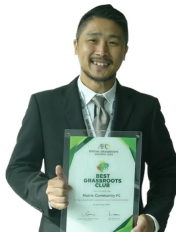
WINNER Matrix Community FC (Malaysia)