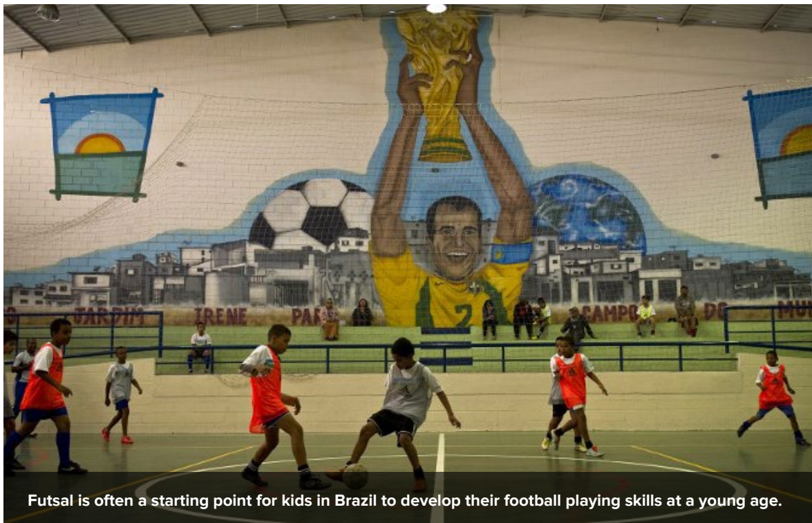
Futsal is often a starting point for kids in Brazil to develop their football playing skills at a young age.

All the top Brazilian players started with futsal. Many clubs promote this because the children, from 8 years upwards, learn the basic skills, learn how to play in small spaces. This 4 v 4 game encourages creativity, involvement, one against one situations. After a few years of this, sometimes up to 13 years old, the children have something to bring to field when they move to the outside game and are confronted with bigger spaces and increased numbers.