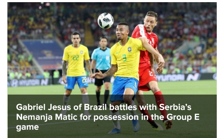
Gabriel Jesus of Brazil battles with Serbia's Nemanja Matic for possession in the Group E game

When you talk about the Brazilian team, the result clouds our opinions because we are expected to win things. Let's face it, against Belgium we created enough chances in the second half to have won the match. Then, the view might have been different. It's true we didn't play particularly well against Mexico or in the first half of the match with Belgium. We were vulnerable to the counter-attack and some players were not at their best. But generally the team was good, and it was a big disappointment that they didn't go further because a lot of opportunities were missed.