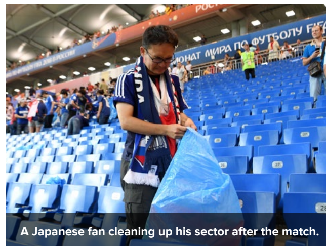
A Japanese fan cleaning up his sector after the match.

For me, the quarter-final clash between Brazil and Belgium in Kazan, was the game of the tournament - the magic of the yellow jersey confronted by the ‘Red Devils’. The former nearly scored after 8 minutes, when Thiago Silva hit the post following a corner from Neymar on the left. But, five minutes later, the ball was in the net. A Nacer Chadli corner, also from the left, was deflected