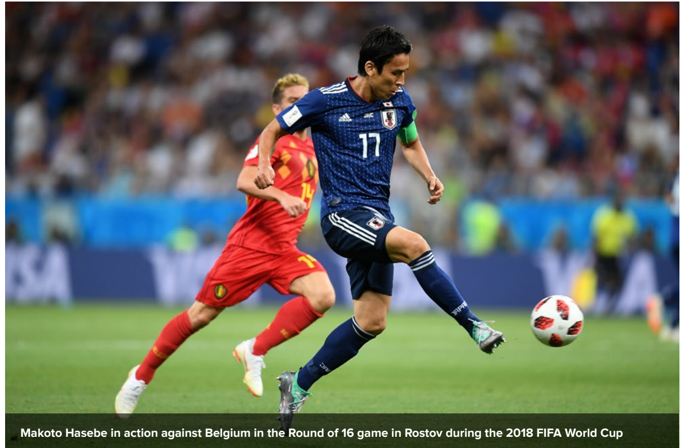
Makoto Hasebe in action against Belgium in the Round of 16 game in Rostov during the 2018 FIFA World Cup

For the first time, the Asian Cup, AFC's premier competition which gets underway in UAE in next month, will have 24 teams in the final tournament and expectations are intensifying. Following the positive vibes of the World