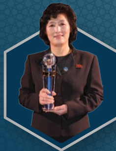
AFC Member Association of the Year (Developing) DPR KOREA FOOTBALL ASSOCIATION