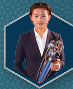
AFC Women's Player of the Year WANG SHUANG (CHI)