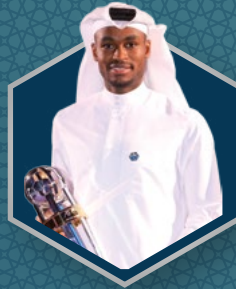
AFC Player of the Year ABDEKARIM HASSAN (QAT)