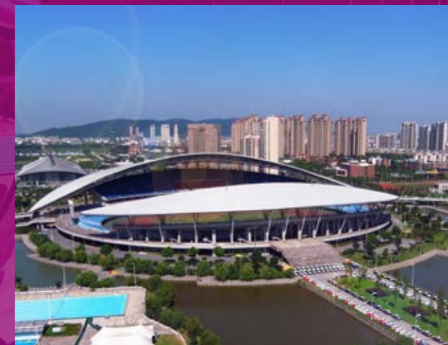
Changshu Sports Centre Stadium Capacity: 30,000