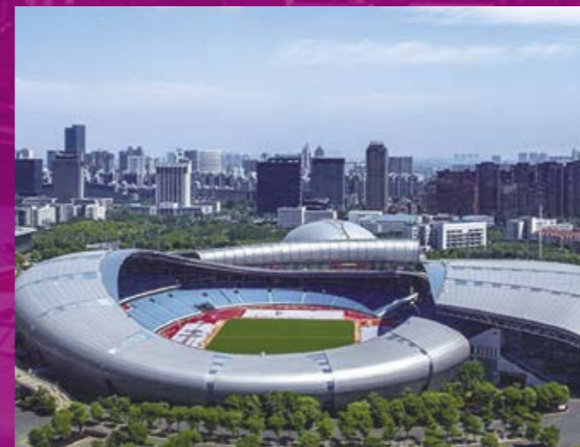
Changzhou Olympic Centre Stadium Capacity: 38,000