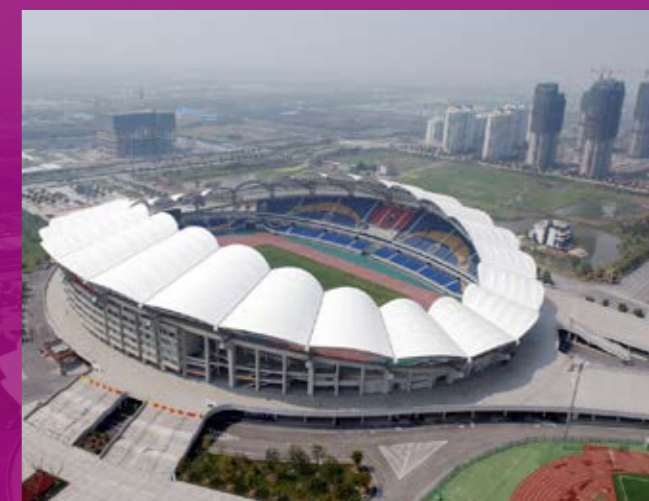
Kunshan Sports Centre Stadium Capacity: 30,000

TNGA Toyota New Global Architecture 丰巢概念