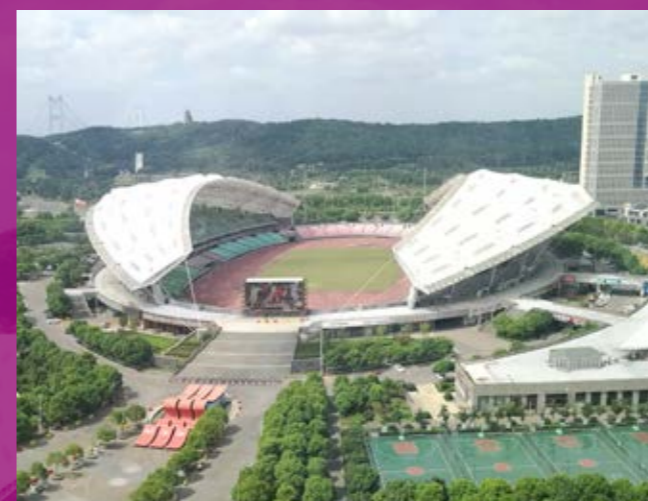
Jiangyin Sports Centre Stadium Capacity: 31,888