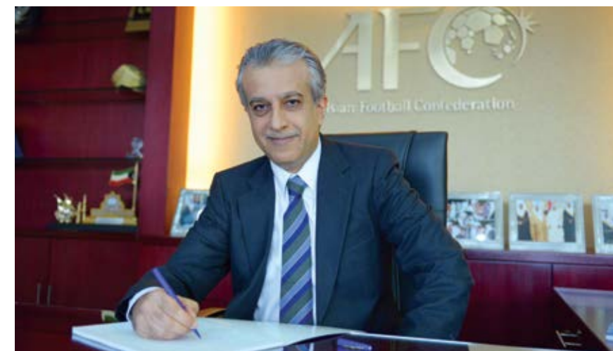
Shaikh Salman Bin Ebrahim Al Khalifa AFC President