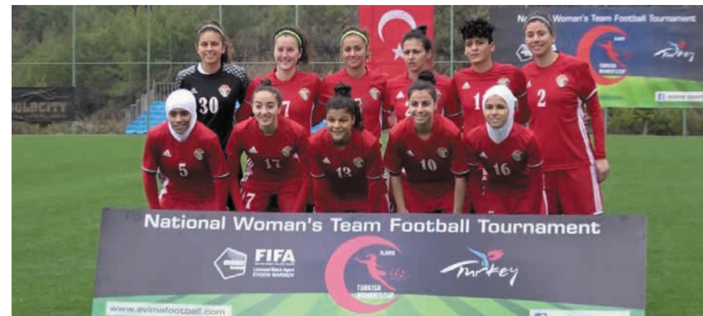
Above 2018 Turkish Women's Cup