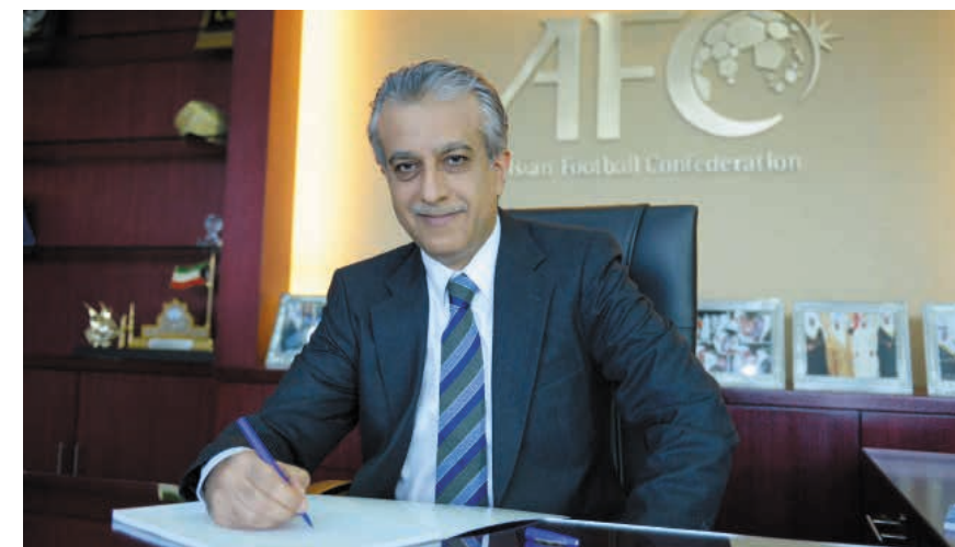
Shaikh Salman Bin Ebrahim Al Khalifa AFC President